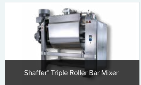
Shaffer ® Triple Roller Bar Mixer

Shaffer offers the most extensive and innovative line of horizontal mixers in the baking industry. Mixers are available with triple roller bar, single sigma, double sigma, or high shear agitators and are custom designed with an enclosed frame, open frame, and open frame hybrid designs. Shaffer engineers every mixer to meet exact product and facility needs to help our customers save money and increase quality.