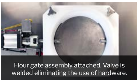
Flour gate assembly attached. Valve is welded eliminating the use of hardware.

The flour gate assembly is compatible with both standard and BFM flour socks. The assembly can be retrofit to existing mixers with some minor adjustments to the existing canopy.